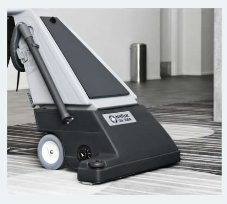
65 cm wide path cleaned in one pass

Specifications and details are subject to change without prior notice.