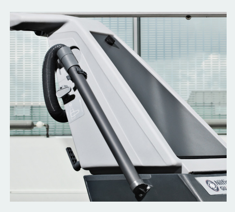
Simple controls and low profile design make operating the unit easier and safer