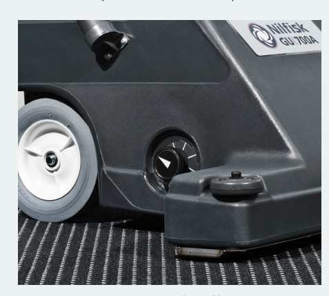
8 brush height positions for effective cleaning of all carpet types