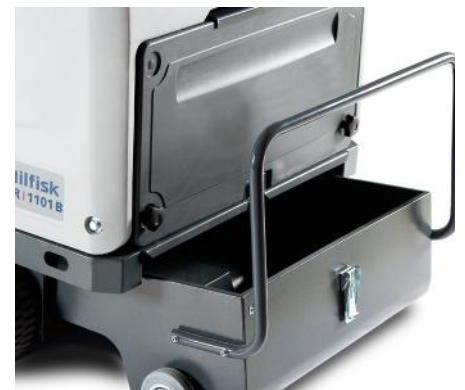
The hopper capacity is extremely large to extend operational time