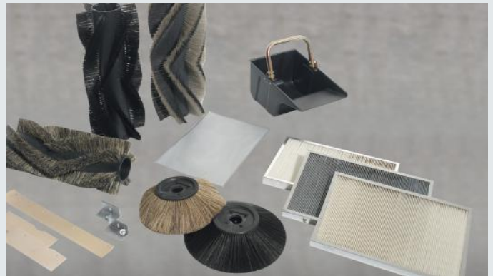
Large range of optional accessories provides the right tools for specific jobs e.g. carpet kit, special filters and brushes, overhead guard, 2x18 litres hopper containers etc.